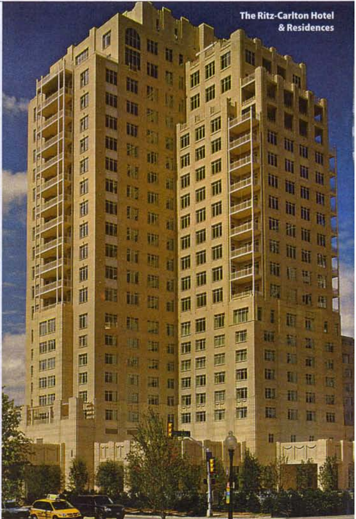
The Ritz-Carlton Hotel & Residences